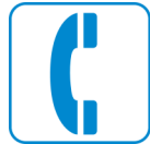
Phone/TTY/ Video Phone